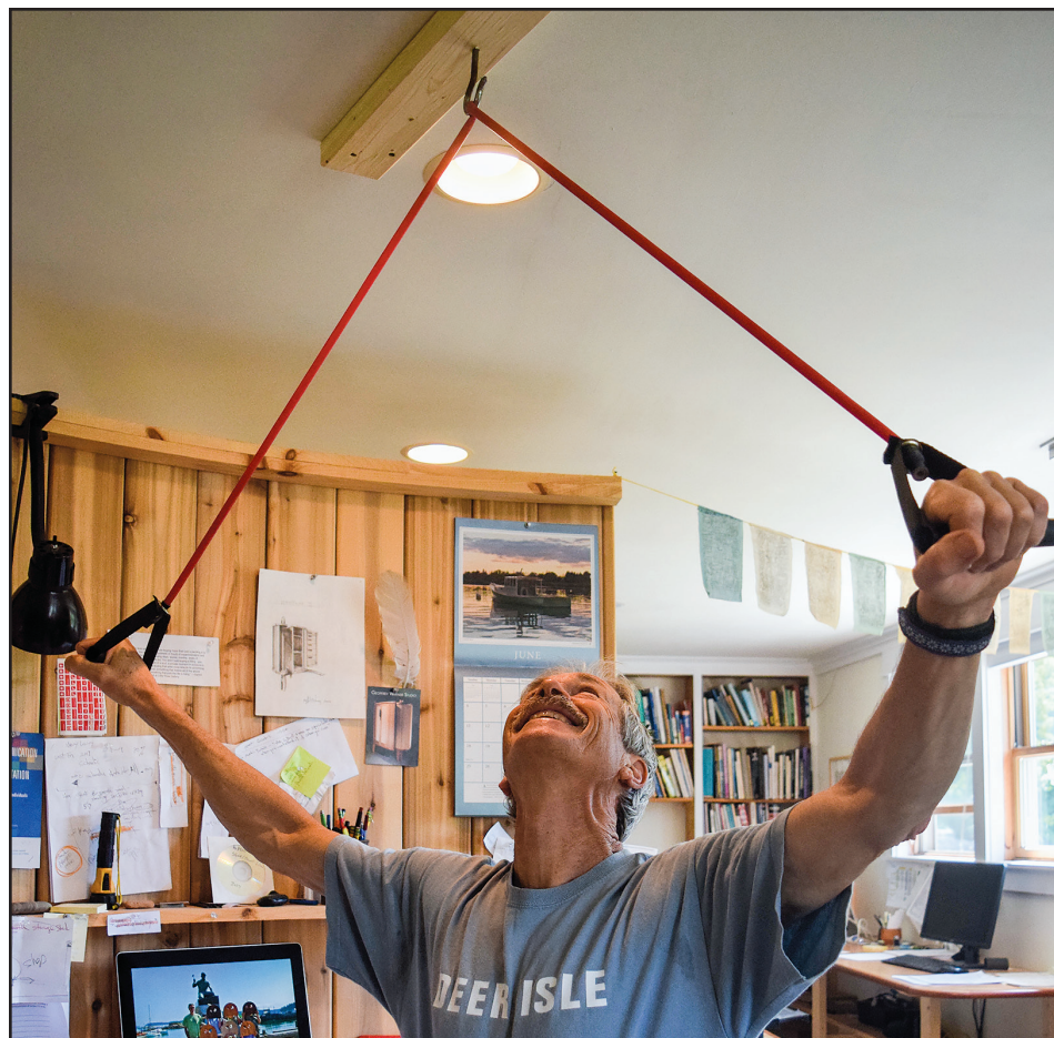
OUT & ABOUT

Where: 43 N. Main St. in Stonington. For more info, call 367-6555, email info@geoffrey-warnerstudio.com and visit www.geoffreywarner-studio.com .