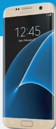
SAMSUNG Galaxy S7 edge